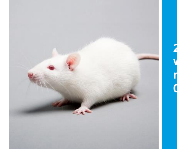
25g lab mouse would normally need 0.3 to 0.5 g of bait